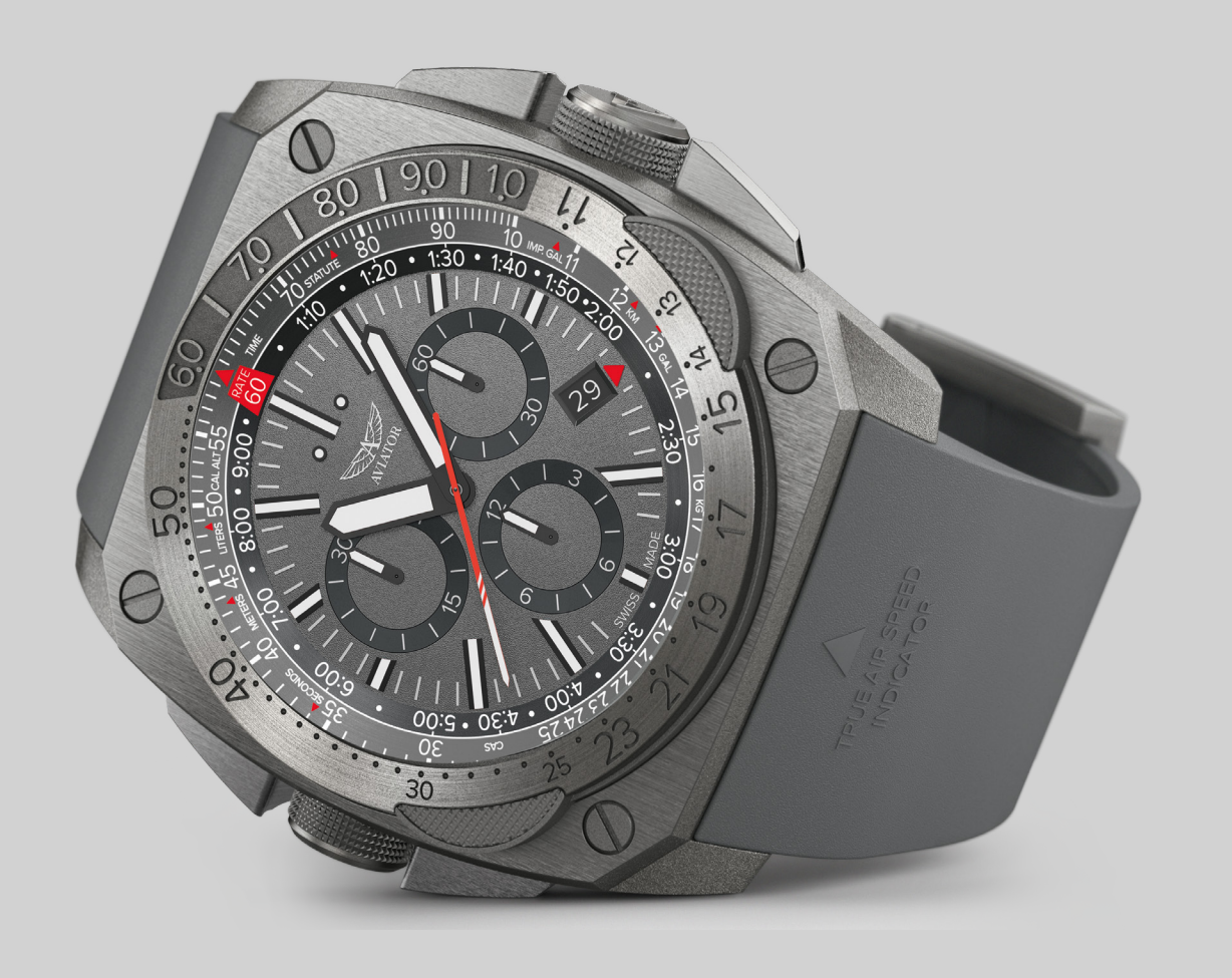
MIG-29 /// SMT CHRONO

The watch model has an unusual story behind its creation. It was there, inside the MIG-29's cockpit, that the first draft of this watch was developed. The design of the case and dial was barely modified, but based on the MIG-29's cockpit clock instrument. Like the MIG-29 fighter is furnished for multirole use, the timepiece has multiple functions such as chronograph aeronautical slide rule.